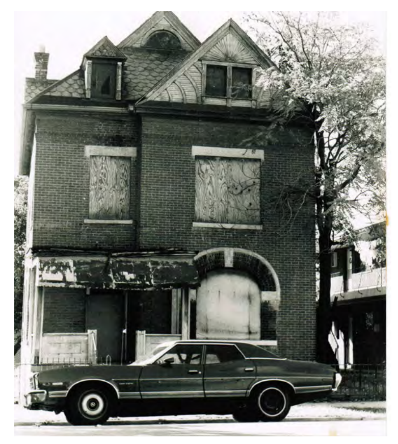
77 Jefferson Avenue, condemned by the City of Columbus, acquired in 1975

A commonly quoted phrase, "the greenest building is the one that's already built," succinctly expresses the relationship between preservation and sustainability.