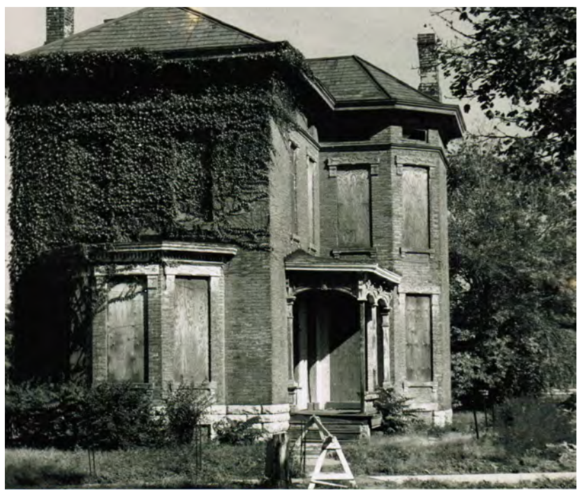
92 Jefferson Avenue, condemned by the City of Columbus, acquired 1975