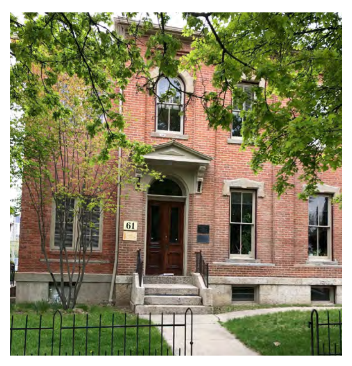
61 Jefferson Avenue with a restored historic brick exterior that highlights the handsome original stone lintels

A commonly quoted phrase, "the greenest building is the one that's already built," succinctly expresses the relationship between preservation and sustainability.