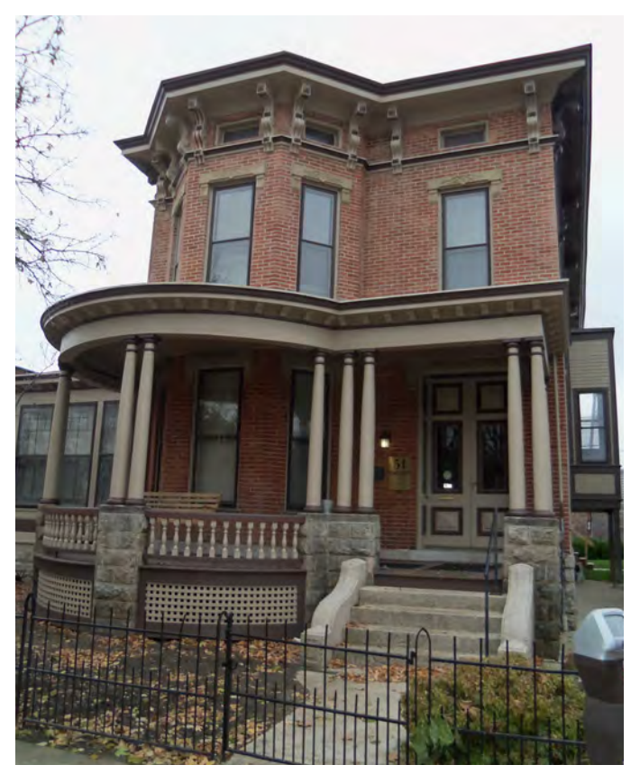
51 Jefferson Avenue with a restored historic brick exterior and a porch swing for coffee breaks

Renovating a deteriorated (condemned in several cases) building is not for the faint of heart. Our architects, builders, board members, and staff have been