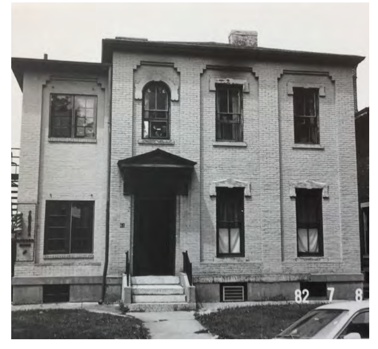
61 Jefferson Avenue, acquired in 1975 with painted brick and an operating barbershop in the basement