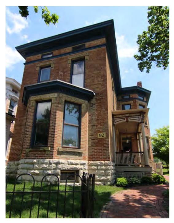
92 Jefferson Avenue with a restoration that brought back the distinctive bay windows