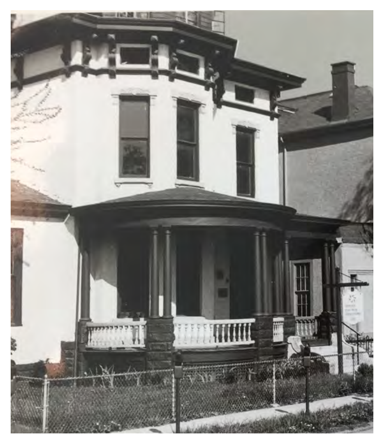
51 Jefferson Avenue, built in 1880 and covered in stucco at some unfortunate later date

Renovating a deteriorated (condemned in several cases) building is not for the faint of heart. Our architects, builders, board members, and staff have been